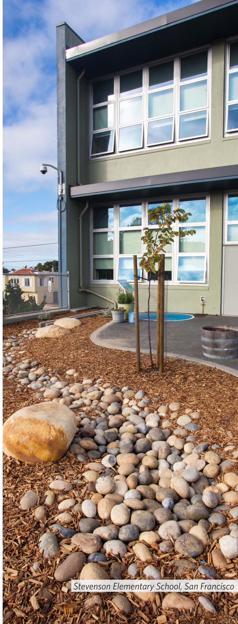
Stevenson Elementary School, San Francisco