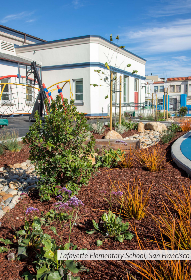
Lafayette Elementary School, San Francisco