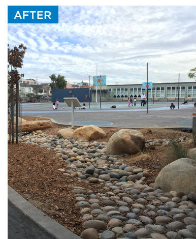
Stormwater Schoolyard, RL Stevenson Elementary, San Francisco