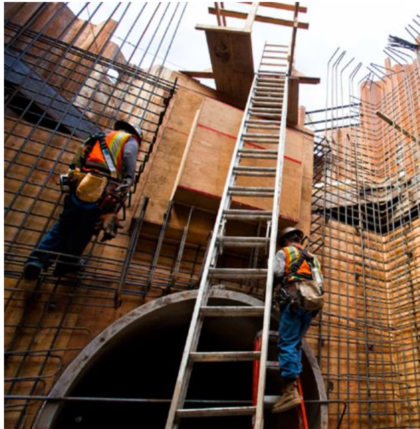
System and Seismic Reliability & Redundancy