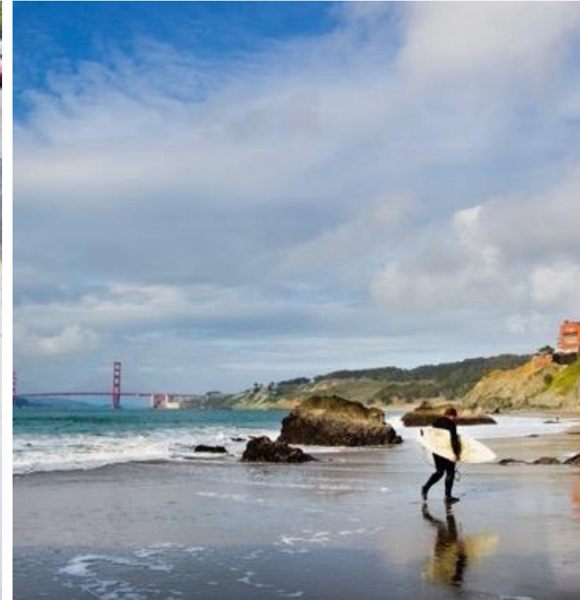
Protecting public health & the environment