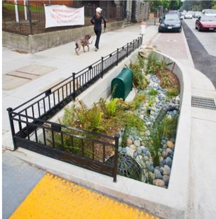
Innovative Stormwater Management Solutions