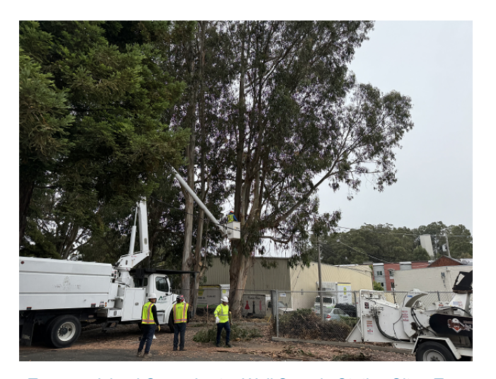
Treasure Island Groundwater Well Sample Station Site - Tree Removal

This project includes multiple construction contracts: (A) WD-2600 Test Well Drilling (completed); (B) Phase 1 WD-2668 Well Station (13 wells; construction completed); (C) Phase 2A WD-2878A- Cathodic Protection and Other Additional Work; and (D) Phase 2B WD-2878B - SSF Main Well. For Phase 1 (Contract B), conversion of as-built drawings to computer-aided design by City staff continued. Preparation of design for fencing and gates at several well stations continued. For Phase 2A (Contract C), startup and testing have started at the Park Plaza, Ben Franklin, and Colma Blvd well sites. Vertical turbine line shaft alignment is also being finalized at the Lake Merced, Colma BART, Linear Park, and Millbrae well sites. For Phase 2B (Contract D), the draft conceptual engineering report for groundwater treatment to address the high levels of ammonia at the Linear Park Well and Treatment Facility was issued. The San Francisco Public Utilities Commission approved the purchase of easements for water and electrical utilities from Kaiser Foundation Hospitals. The Board of Supervisors approved to execute a Purchase and Sale Agreement and Easement Deed with San Mateo County Flood and Sea Level Rise Resiliency District for the acquisition of a 1,386-square-foot easement for an aerial water pipeline crossing and associated footings and braces across a portion of San Mateo County's property. Contractor continued preparation of