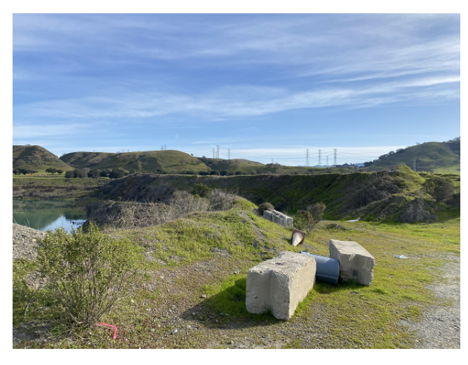
Access Road leading into Pond F2