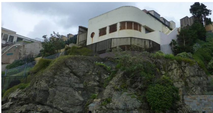
Seacliff 2 Pump Station viewed from the beach.

Originally built in the 1930-40's, our Seacliff 1 & Seacliff 2 Pump Stations provide essential sewer service to parts of the Seacliff area. These pump stations connect to the existing sewers under El Camino Del Mar Drive, and ultimately to our Oceanside Treatment Plant. Both facilities are at the end of their useful life and in need of upgrades.