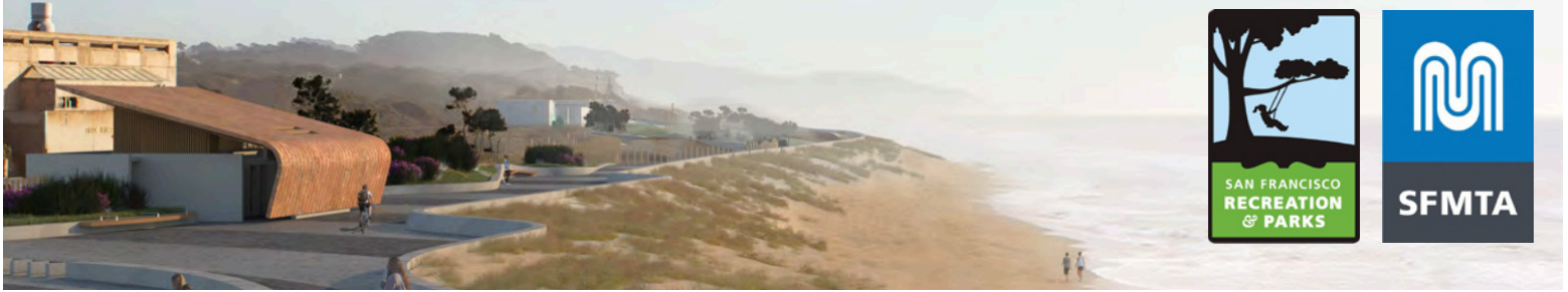
Rendering of Project View - Great Highway/Sloat Boulevard Intersection Looking South

SEWER SYSTEM IMPROVEMENT PROGRAM Grey. Green. Clean.