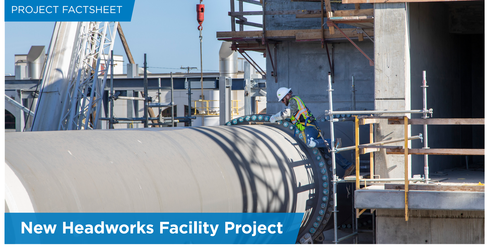
Pictured above: New Headworks Facility Project Construction