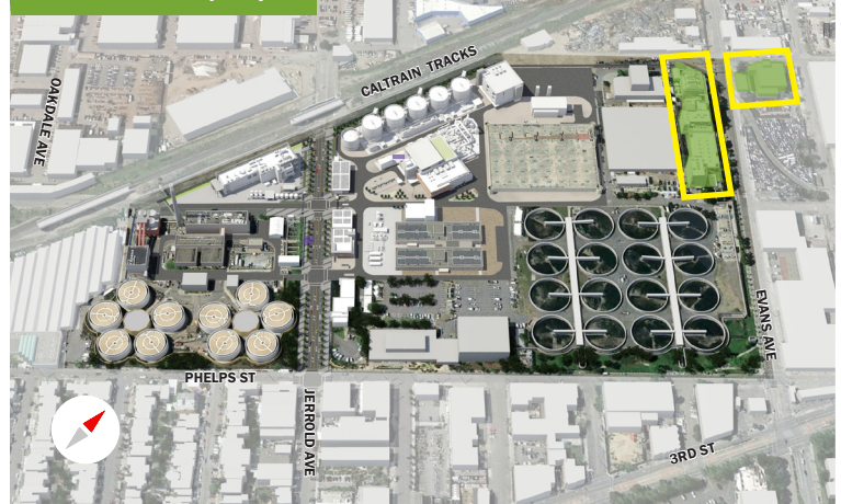
Headworks Facility Project