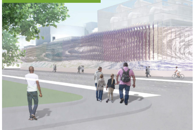
The San Francisco Public Utilities Commission and the San Francisco Arts Commission are commissioning artwork for the new Headworks facility.