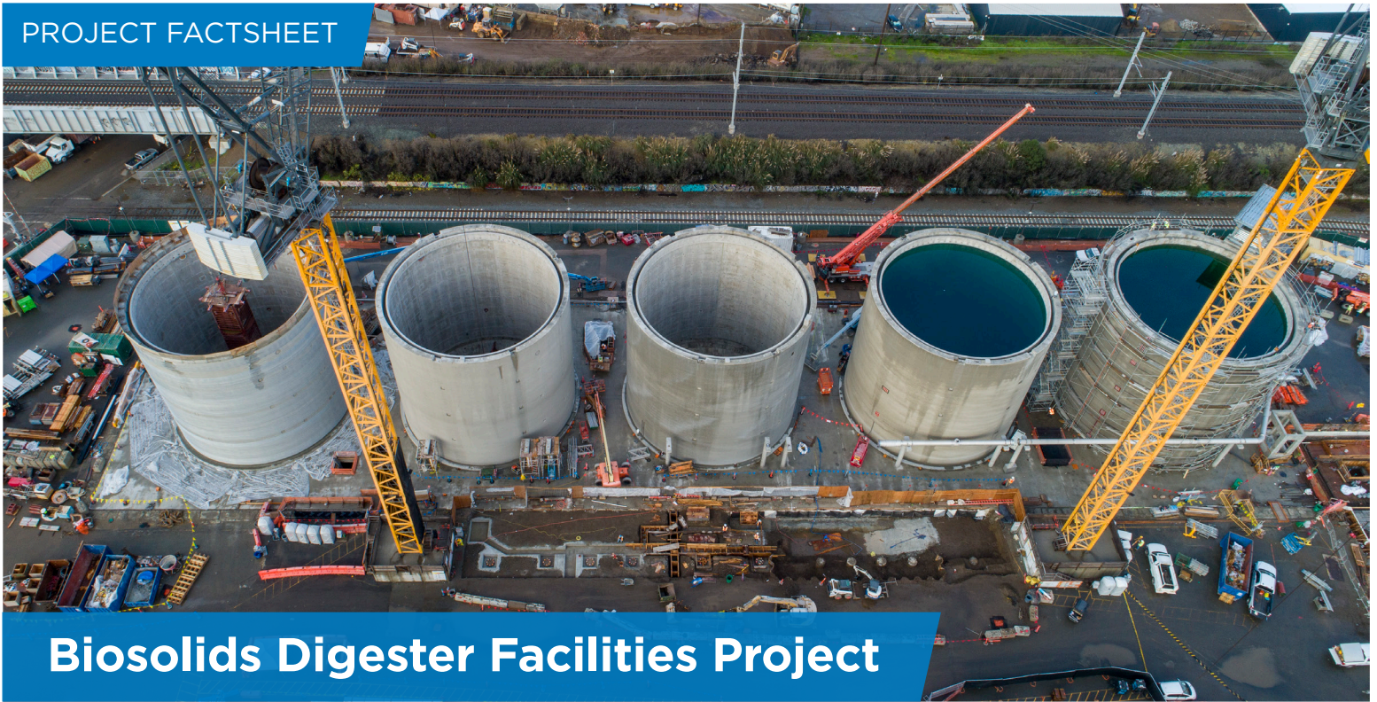
Pictured above: Biosolids Digester Facilities Project Construction