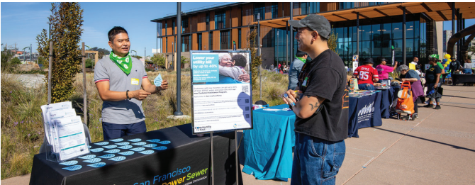
Southeast Community Center (SECC) at 1550 Evans.

The Southeast Community Center at 1550 Evans Avenue features an expanded low-cost childcare center, nonprofit workspaces, community meeting rooms, large multi-purpose rooms, and a stand-alone Alex Pitcher Pavilion for community events. The open spaces include an amphitheater, gardens, outdoor dining areas, and play spaces for children. The new center provides a wide range of workforce development and education services for Southeast residents of all ages. sfpuc.gov/learning/come-visit/southeast-community-center