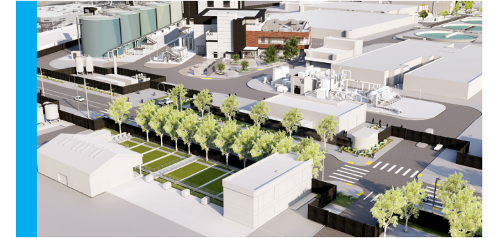
Rendering of future Biosolids Digester Facilities looking northwest from Jerrold Avenue.