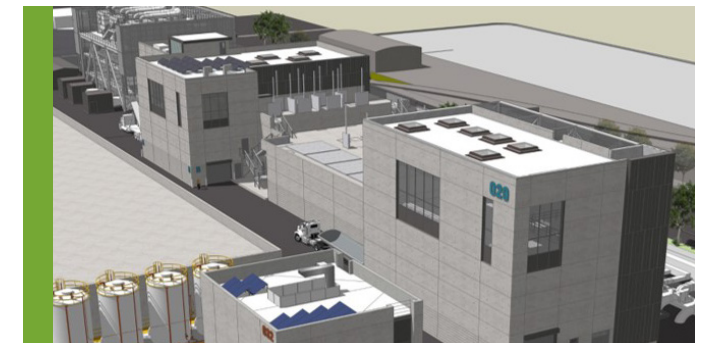
Rendering of the New Headworks Facility looking west from Phelps Street.

The Headworks Facility is where the wastewater flows enter the treatment plant, and debris (such as bricks) and grit (like sand) are removed. This process is critical to protect downstream equipment, help control odors, and ensure that the SEP can operate efficiently. sfpuc.org/headworks