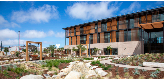
Southeast Community Center (SECC) at 1550 Evans.

The Southeast Community Center at 1550 Evans Avenue features an expanded low-cost childcare center, nonprofit workspaces, community meeting rooms, large multi-purpose rooms, and a stand-alone Alex Pitcher Pavilion for community events. The open spaces include an amphitheater, gardens, outdoor dining areas, and play spaces for children. The new center provides a wide range of workforce development and education services for Southeast residents of all ages. southeastcommunitycenter.com