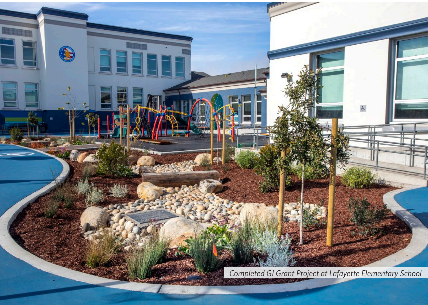
Completed GI Grant Project at Lafayette Elementary School

Please review the Application section of the Grant Program Guidebook and the application checklist on the following page prior to submitting your application.