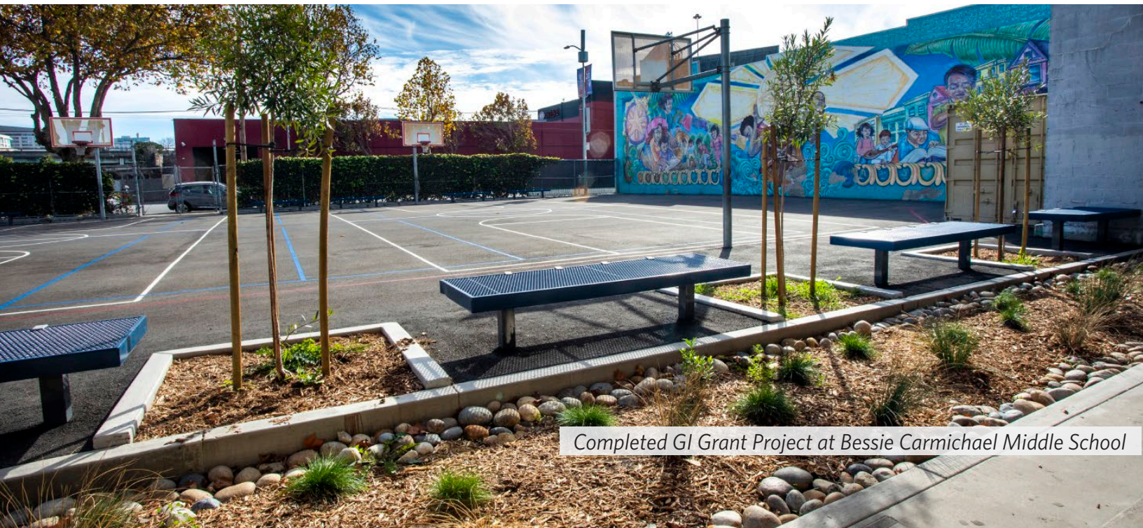
Completed GI Grant Project at Bessie Carmichael Middle School