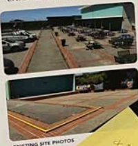
EXISTING SITE PHOTOS