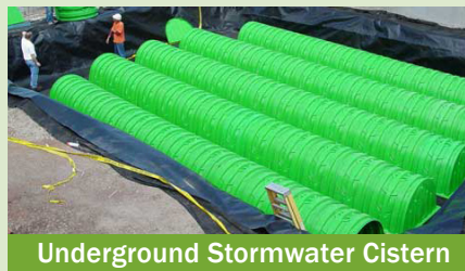
Underground Stormwater Cistern

Capture stormwater runoff from streets, roofs, and parking lots. Plants and soil absorb that water, reducing the amount of runoff overwhelming the sewer system.