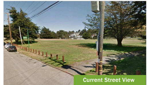
Current Street View

The Upper Yosemite Creek Daylighting Project is a result of close coordination with San Francisco Recreation & Parks Department and public input from the local community and is the last of eight SFPUC green infrastructure pilot projects, which have been constructed over the last few years. These projects are part of the Sewer System Improvement Program (SSIP), a multi-billion dollar citywide investment to upgrade our aging sewer infrastructure for generations to come.