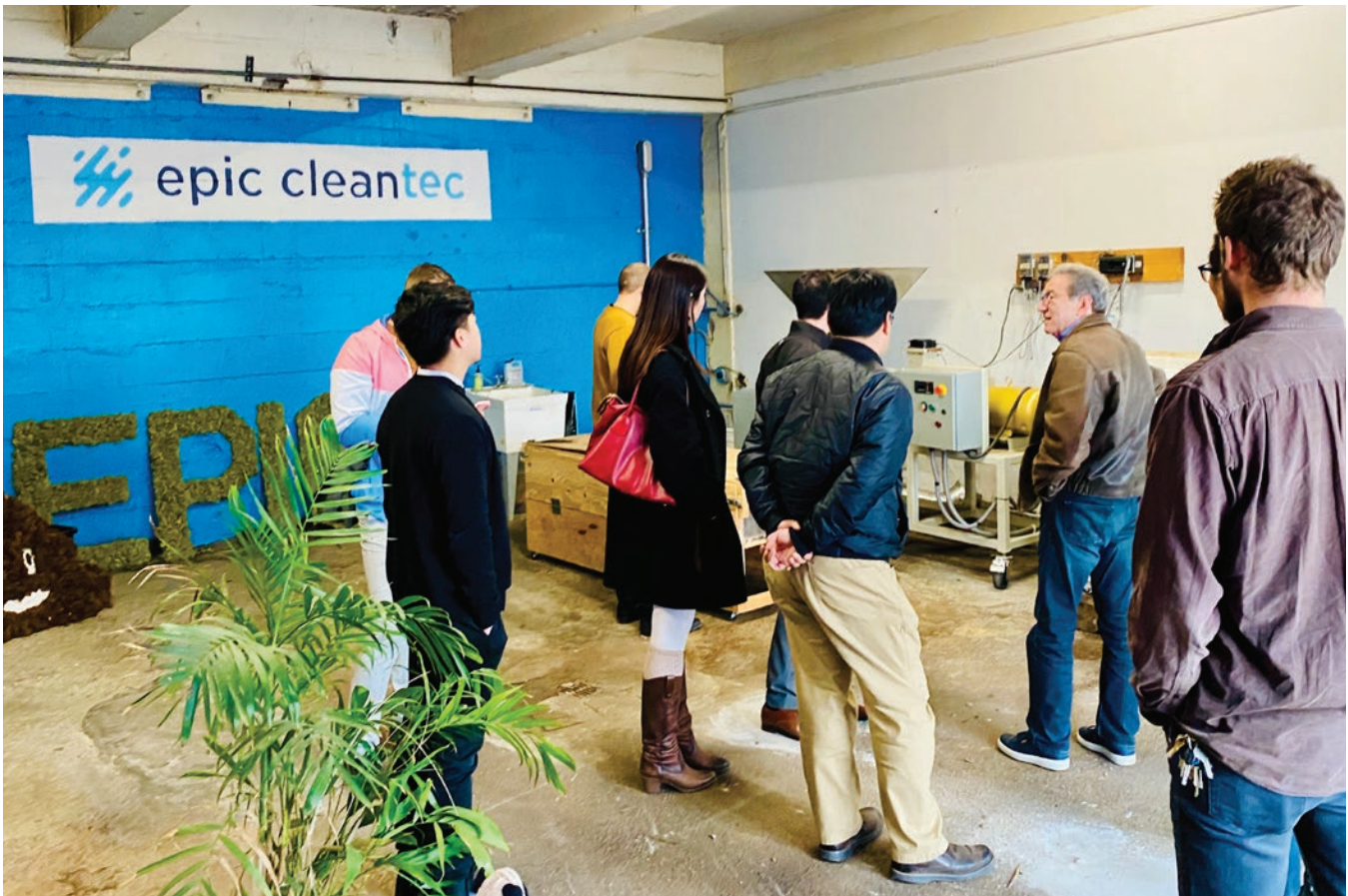
Tour of solids processing operation