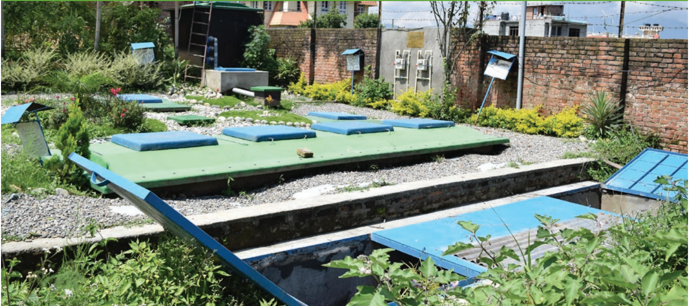
A view of the treatment plant's prefabricated modules