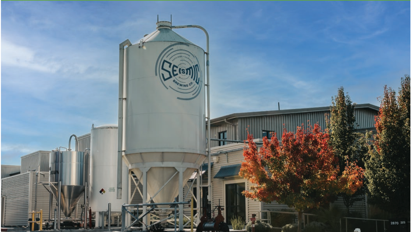
Seismic Brewing facility