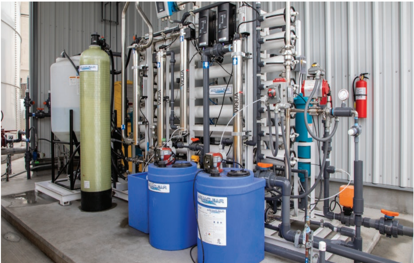
Anchor Brewing Company's brewery process water recycling system