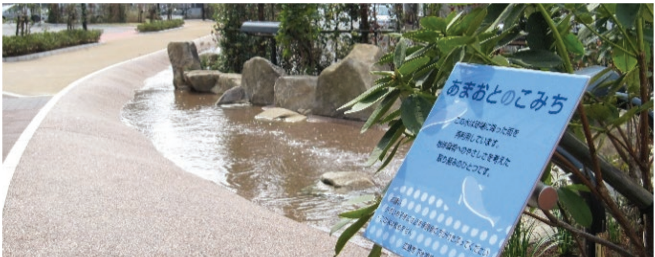
The circulating playground water feature “Amaoto No Komichi”