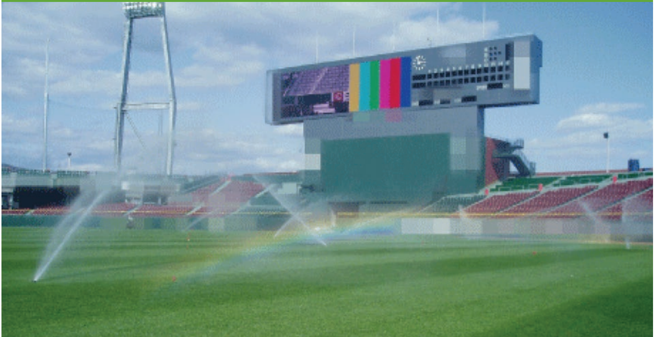
The baseball field’s rainwater fed sprinkler irrigation system