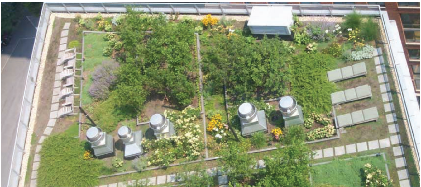
The green roof reduces runoff, insulates the building, and is irrigated by the onsite reuse system

Reference: Miroslav Salon, Albanese Organization ( msalon@verdesian.com ), (212) 528-2200