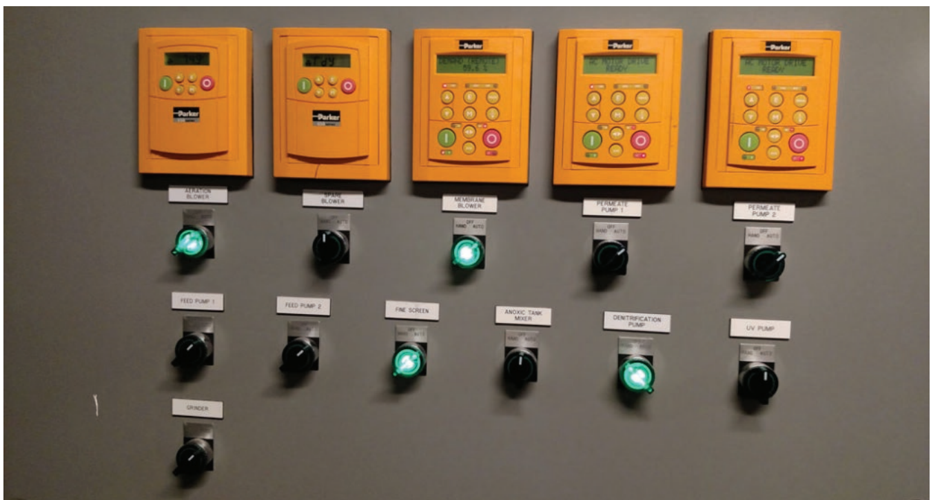
The onsite reuse system’s control panel