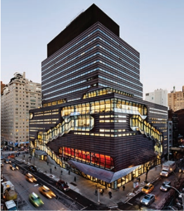
The New School's University Center