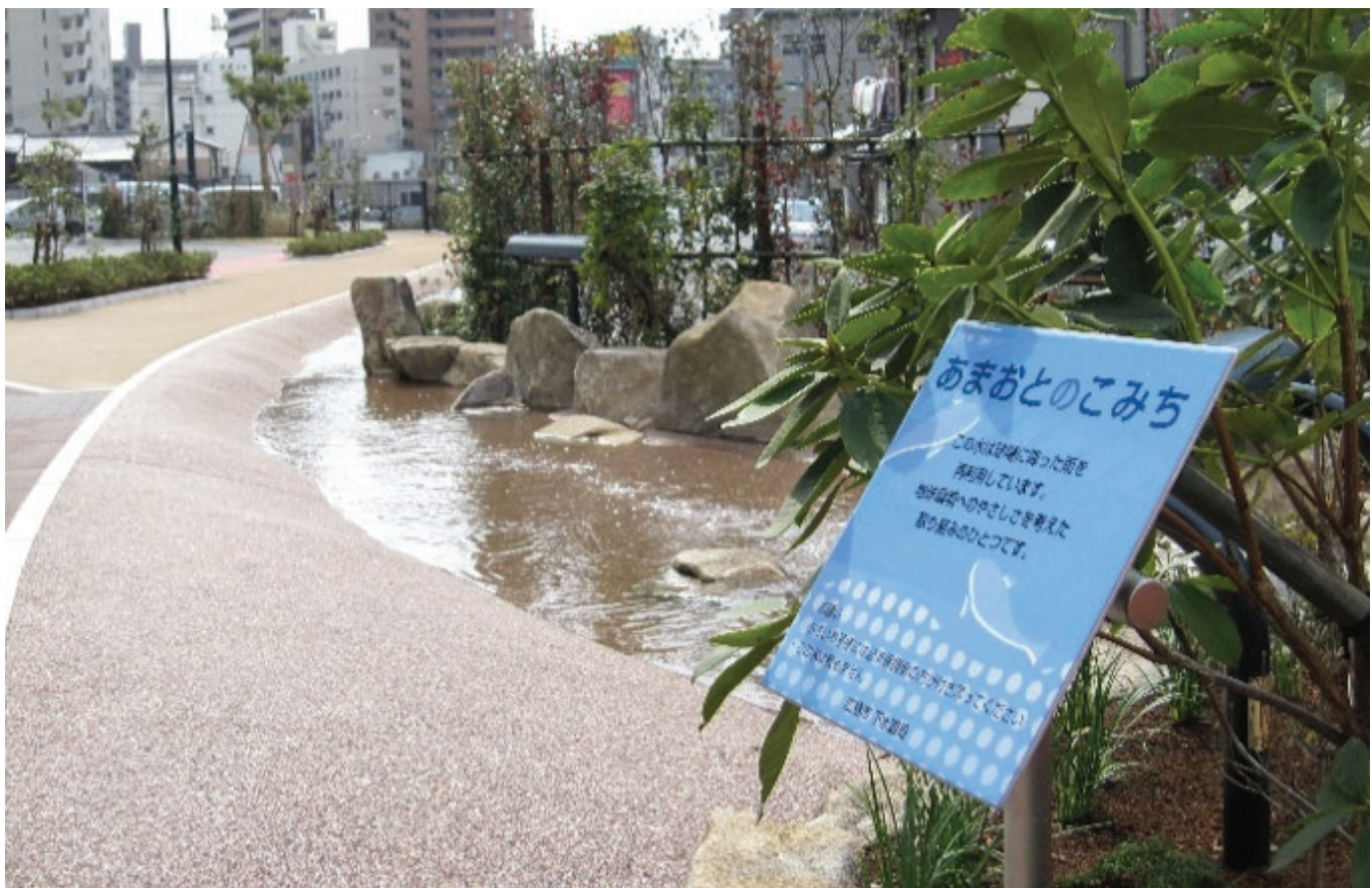
The circulating playground water feature “Amaoto No Komichi”

Reference: Hiroshima City Government, Sewerage Bureau, Facility Management Department, Planning and Management Section ( g-keikaku@city.hiroshima.lg.jp )