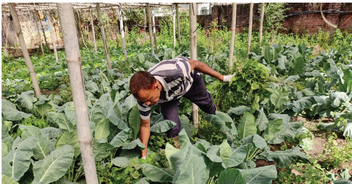
The orphanage farm utilizes recycled water for irrigation and treated bio-solids for soil fertilizer

Reference: Rajendra Shrestha, Environment and Public Health Organization (ENPHO) ( rajendra.shrestha@enpho.org ) (977-1- 5244641, 5244051)