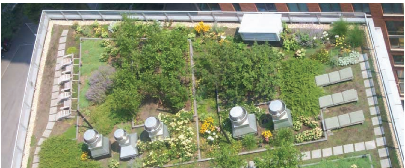
The green roof reduces runoff, insulates the building, and is irrigated by the onsite reuse system