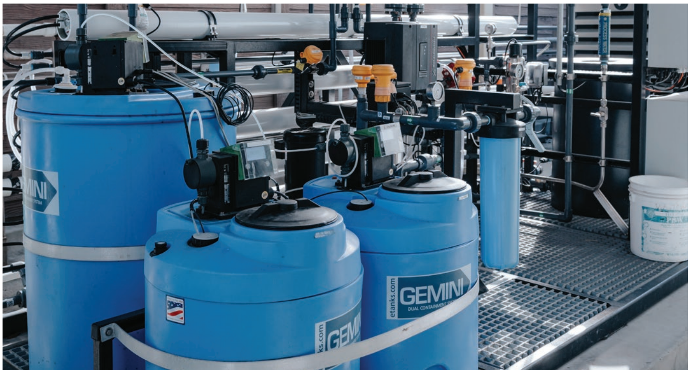
Treatment system RO skid