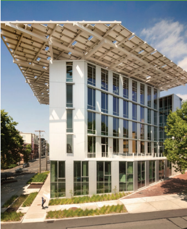
The Bullitt Center