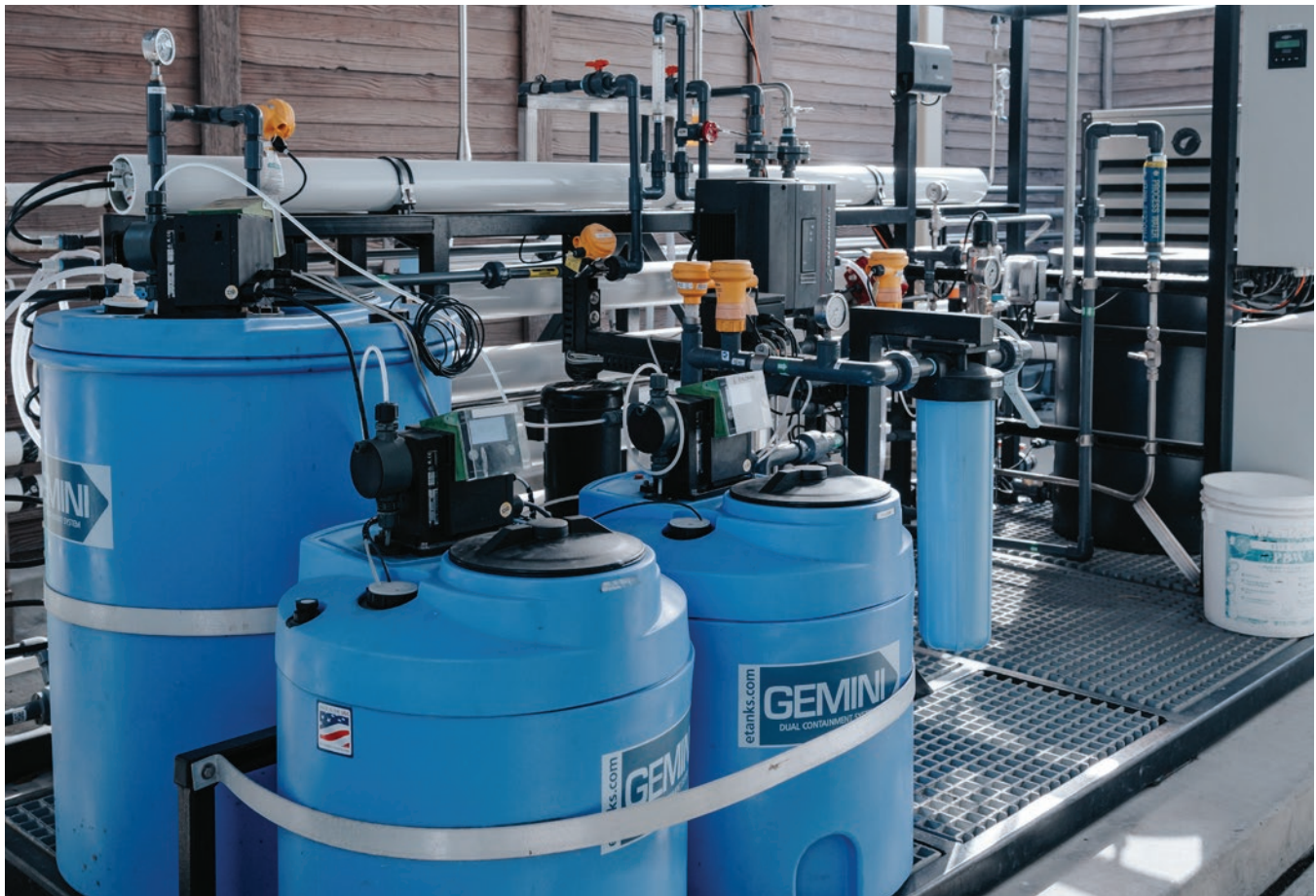
Treatment system RO skid

This report highlights developments in San Francisco, as well as other national and international projects, that have incorporated innovative technologies to reuse water and recover resources. Opportunities exist for buildings to not only recycle water onsite, but become vehicles for resource recovery, tapping into the potential for thermal heat, nutrient and biosolids recovery as well as a potential source of drinking water. These projects are providing multiple benefits, encouraging testing of forward-thinking ideas, and promoting opportunities to develop partnerships. Information about San Francisco's Innovations Program is available at sfpub.org/programs/future-water-supply-planning/innovations . More information about San Francisco's Onsite water Reuse Program is available at sfpub.org/construction-contracts/design-guidelines-standards/onsite-water-reuse .