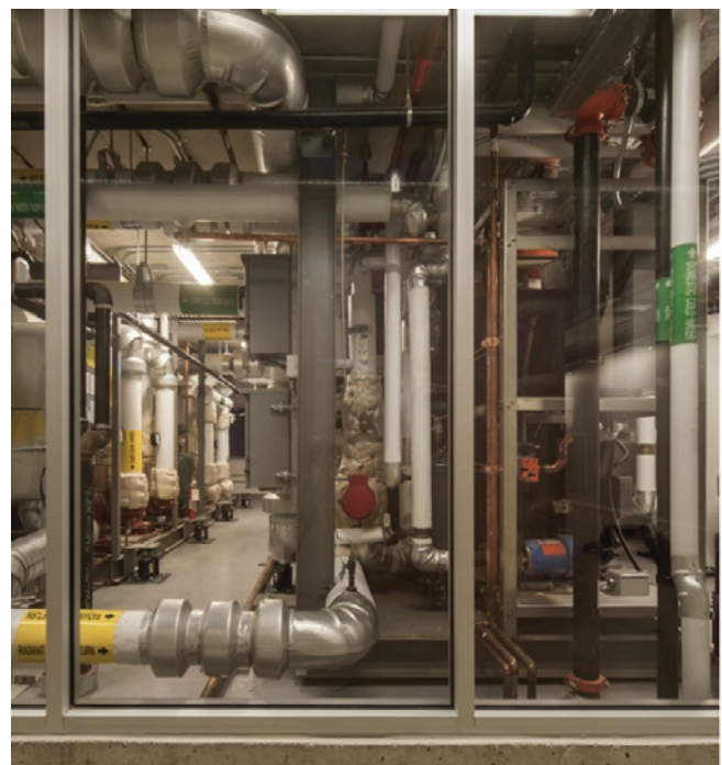
Onsite reuse system (image from Gray & Osborne Inc., Consulting Engineer's Bullitt Center Water Treatment System Engineering Report)

Additional Information: https://bullittcenter.org/2018/11/01/rainwater-to-potable-water-system-is-live/