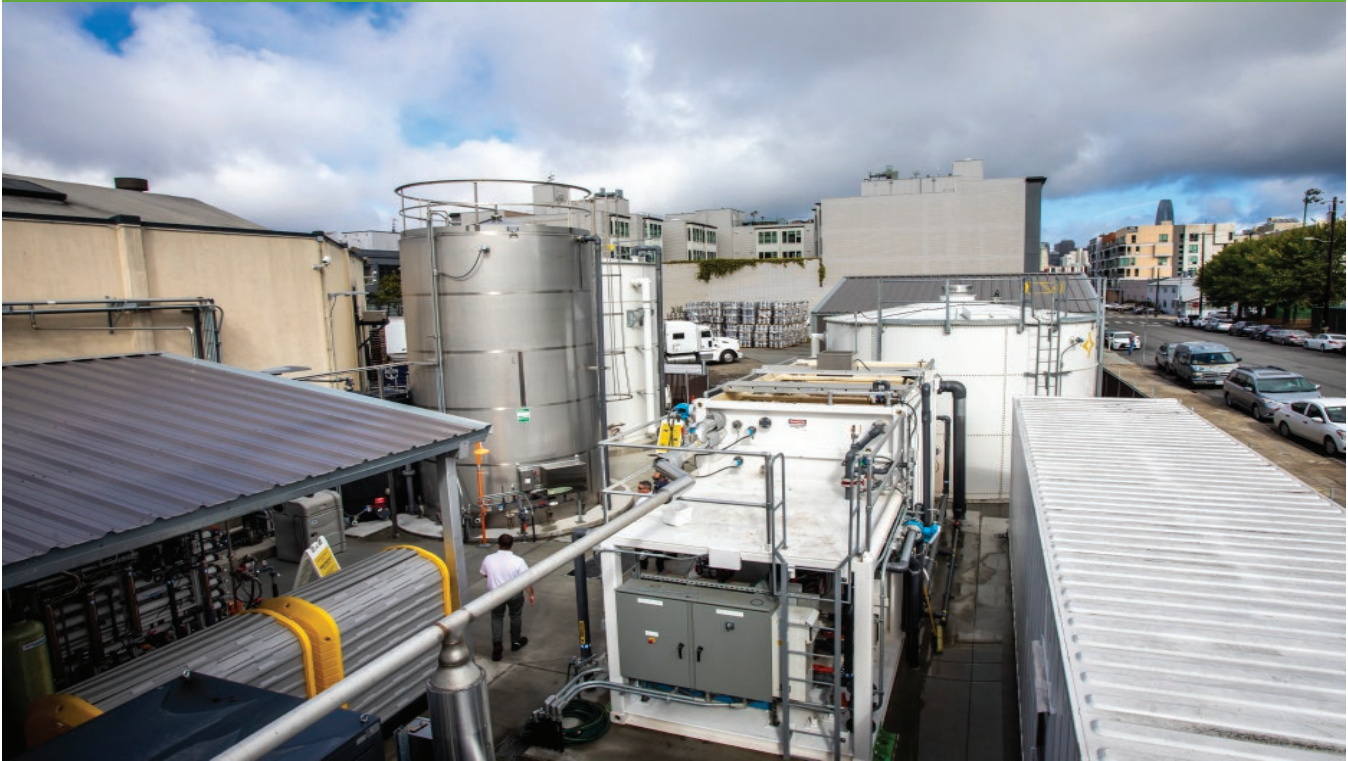
Anchor Brewing Company