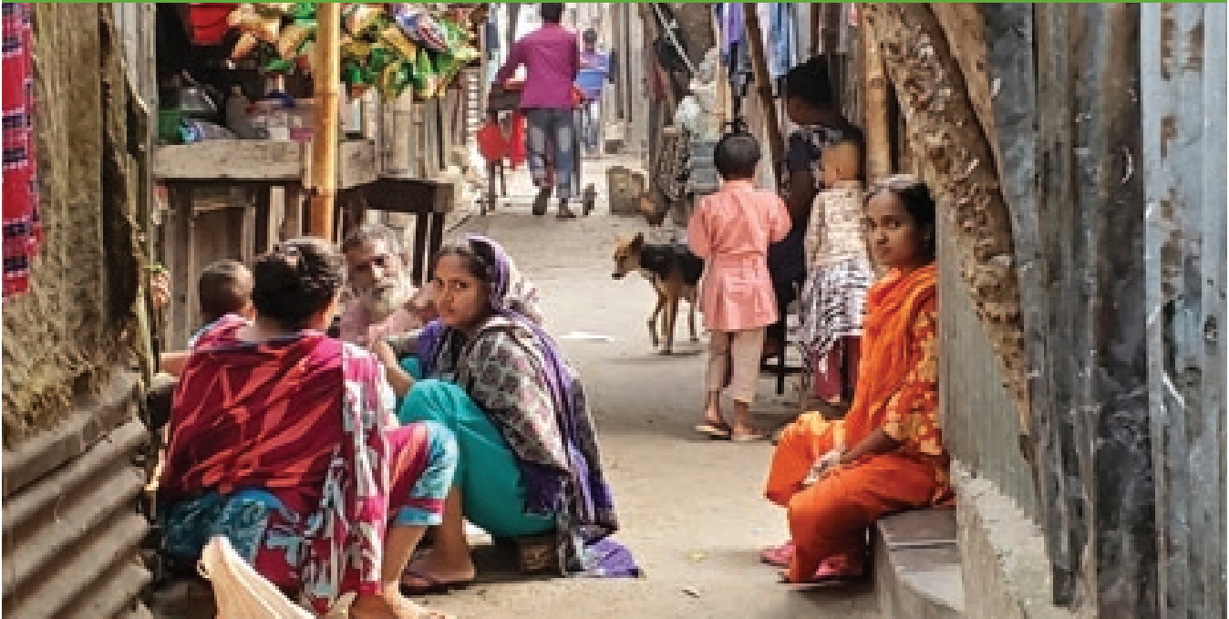
Vashantek community post installation