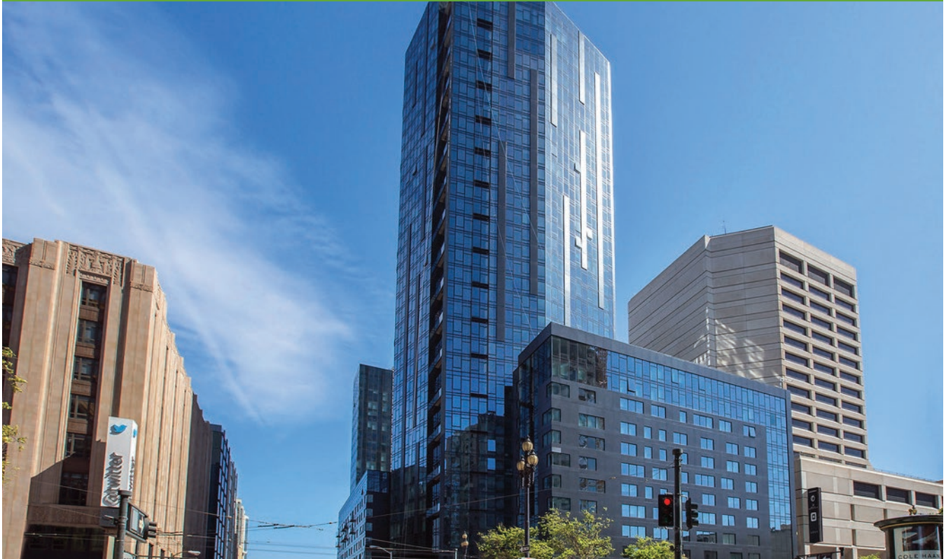
NEMA apartment complex