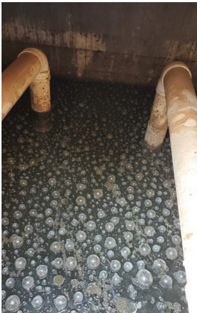
Tarabo anaerobic treatment at work

Reference: Steve Deem, Water 1st International ( stevedeem@water1st.org )