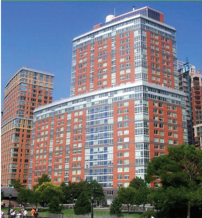
The Solaire residential tower