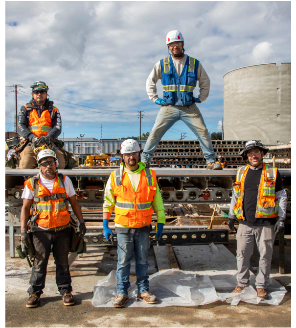
Crews take a quick break as they prepare to lift a 60,000-pound steel lid onto Biosolids Digester.