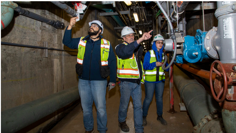
Crews inspect areas of existing Headworks as they prepare for New Headworks substantial completion.