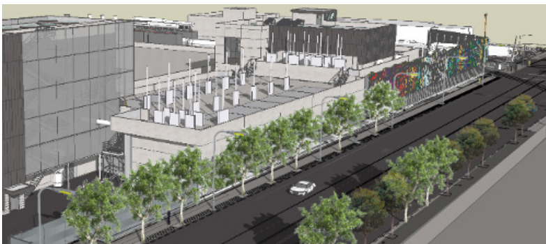
A rendering of Evans Avenue restoration, looking toward Rankin Street, includes sidewalk and curb restoration, plus lighting and tree planting.