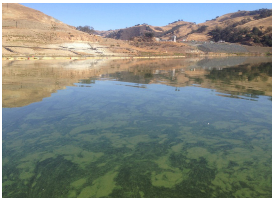
Calaveras Reservoir with blue-green algae on surface

Adverse health impacts, which are rare, have been reported elsewhere from algal toxins in drinking water associated with algal blooms in source water reservoirs. However, while at times algal toxins are present in the SFPUC reservoirs, algal toxins have never been detected in drinking water we deliver due to SFPUC treatment methods.