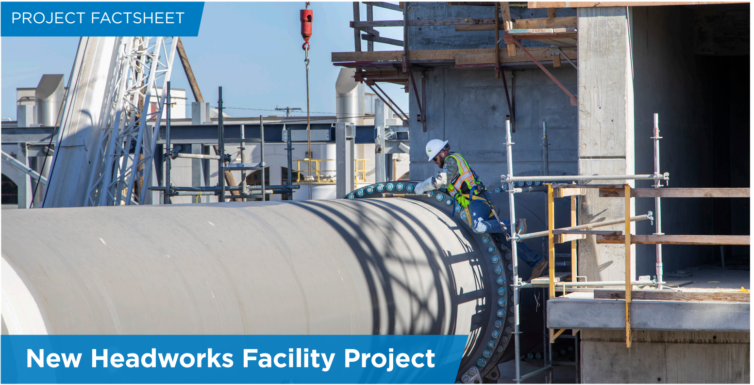
Pictured above: New Headworks Facility Project Construction